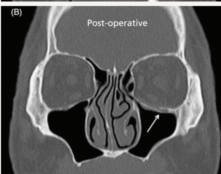
Preoperative and postoperative CT scan of fracture with interval between pre and postoperative CT scans - 15 months.

Teo L, Teoh SH, Liu Y, Lim L, Tan B, Schantz JT, et al. A Novel Bioresorbable Implant for Repair of Orbital Floor Fractures. Orbit. 2015;34:192-200.